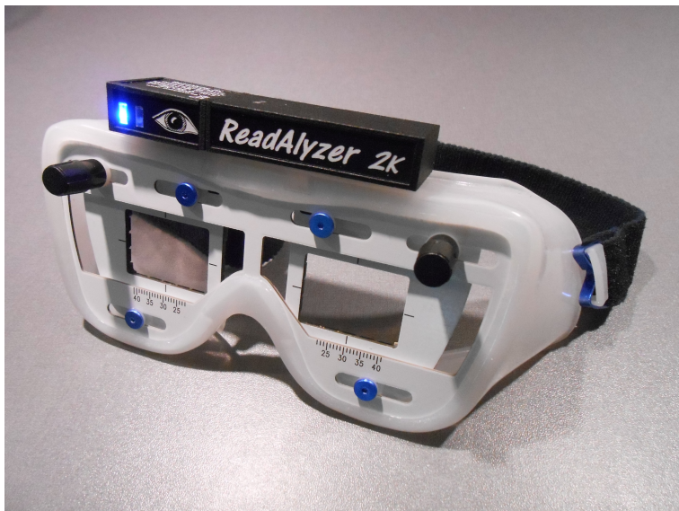
Goggles from side in measuring mode