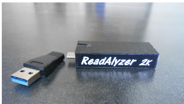
Battery pack with USB A adapter